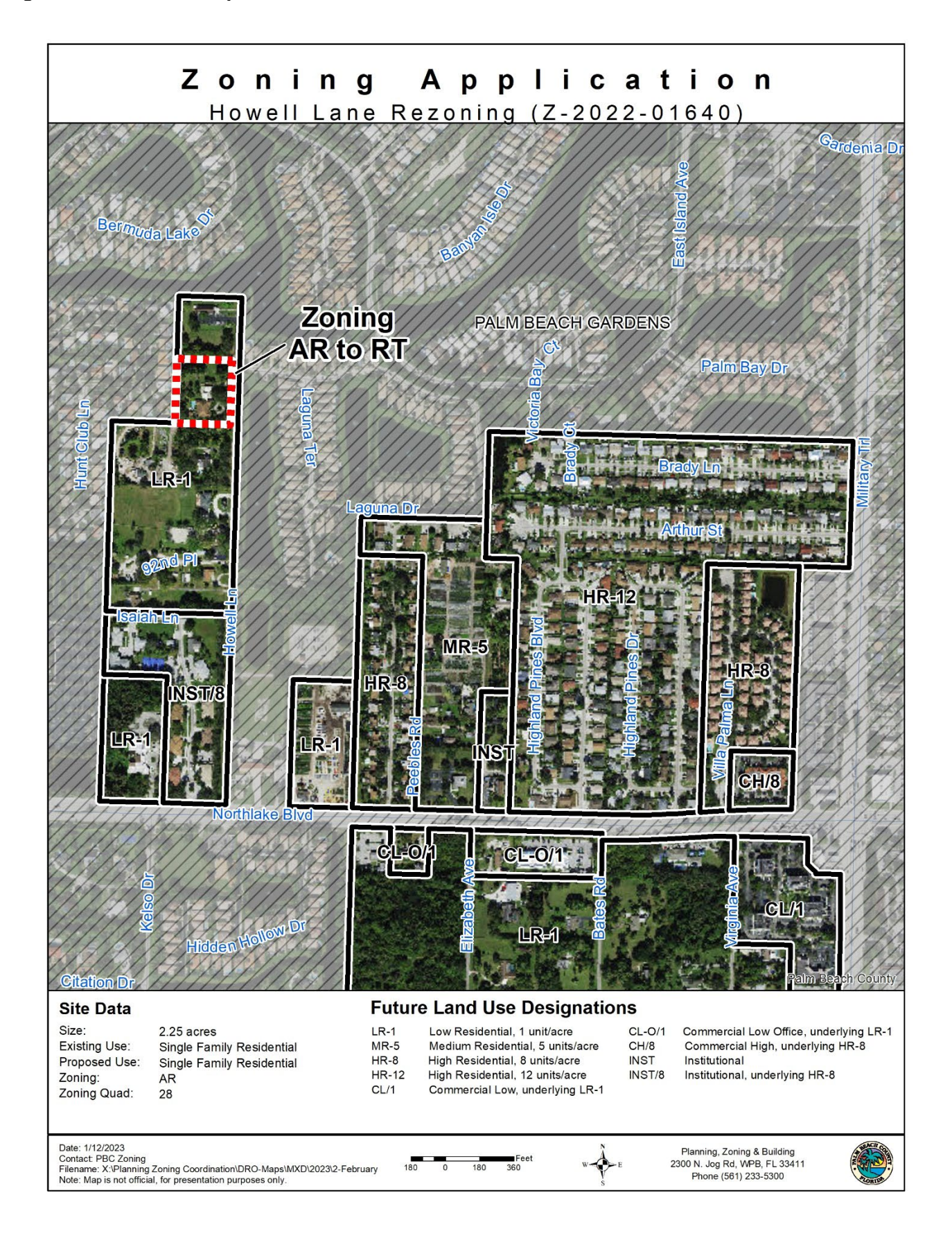
Figure 1 - Land Use Map